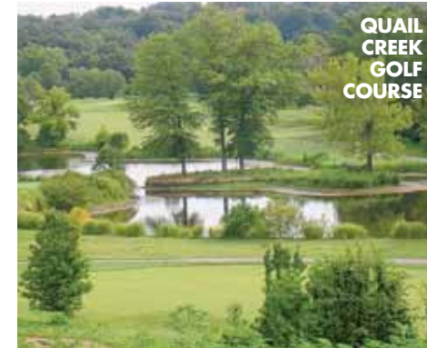
QUAIL CREEK GOLF COURSE

The Eagle Springs Golf Course offers an 18-hole championship course and nine-hole, par 3 course. The clubhouse has a pro shop, restaurant, banquet facilities with restrooms, a putting green, driving range and convenient cart paths. Weekend tee times may be reserved from April through September. For more information visit www.eaglesprings.com or contact Eagles Springs Golf Course at 314-355-7277.