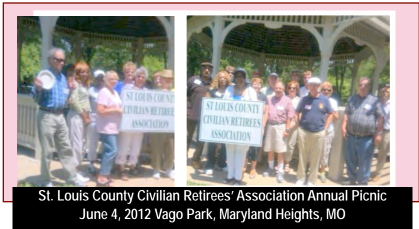
St. Louis County Civilian Retirees' Association Annual Picnic June 4, 2012 Vago Park, Maryland Heights, MO