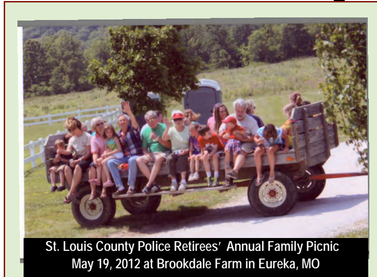
St. Louis County Police Retirees' Annual Family Picnic May 19, 2012 at Brookdale Farm in Eureka, MO