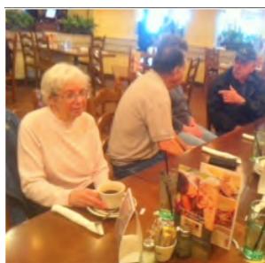
After tour food and fellowship at Olive Garden