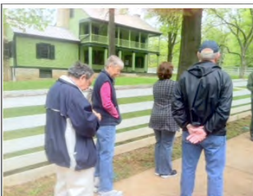
Museum tour experience