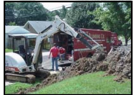
St. Louis County's Sewer Lateral Repair Program pays for hundreds of major repair jobs like this every year.

fee on all residential homes and condos in unincorporated St. Louis County and some municipalities.