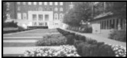
A black-and-white photograph can't do justice for the soon-to-be brimming-with-color boxes, pots and gardens, as in Memorial Park in 2002.

PLANTING ANNUALS IN THE SPRING - The staff then plants annual flowers – 4,050 plants are planned for 2003 – right after the last frost has hit,