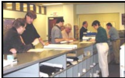
Permit Processing Staff work with the public.

thinking about building a new home or remodeling your existing home? Are you going to build a retaining wall or install a swimming pool? Public Works oversees all those projects. We have plan reviewers who look over the drawings for the project to make sure they are complete and correct before a permit can be issued. Our permitting staff process the applications for permits and issue the permits to the homeowner or contractor. The inspection staff go out to the construction site and make sure the project is being built in accordance with the plans and the codes. They also investigate possible code or zoning violations for existing buildings or homes.