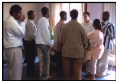
Youths listening to a job opportunity.

A Job Fair for youth was held on June 23, 2003, at the World Trade Center. Sponsored by the Office of Family and Community Services' County Youth Programs (CYP), the fair was designed to introduce youth to employment opportunities and assist them in securing employment. Sixty youth attended from CYP's Doors To Success Program, the Family Court's Youth Opportunities Unlimited program, Lakeside Center, and various organizations in the community. This project was planned by a committee of employees