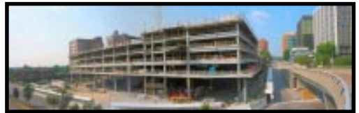
Shaw Park Garage and Transit Center

connection to the MetroLink station) is the biggest project we currently have in process. We also have a new health clinic for North County Residents nearing completion.