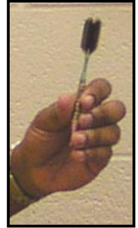
A soft dart